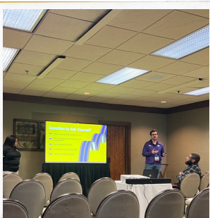
Campus Collaborations for the Residential Experience Program of the Year