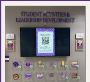
New SALD Wall in GUC

Check out the Student Activities & Leadership Development Wall! Located just outside of Student Engagement, this dynamic space celebrates our RSOs and Student Leaders of the Month, highlights our yearly traditions, and features our rotating advertisements on the TV to keep you informed on what's happening across campus. It's a great way to recognize involvement, leadership, and the impact our students make every day. This space also serves as a central hub for sharing important updates and upcoming opportunities for students to get involved. Haven't seen it in person yet? Be sure to stop by and take a look.