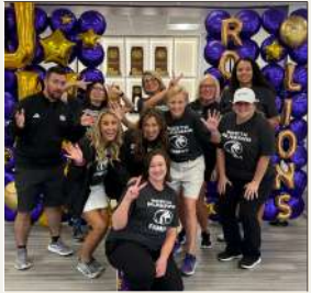
Family Weekend Workers

The 3rd Annual UNA Family Weekend was a huge success, welcoming 1,102 attendees—an impressive 10% increase over 2024! This year, we launched upgraded platforms that made registration, payment, and check-in faster and easier than ever. With the support of 20 incredible campus partners and overwhelmingly positive feedback from our families, this weekend truly showcased the best of the UNA community. Family Weekend continues to strengthen the connection between our students, their supporters, and the UNA experience. We are grateful to everyone in the division who helped bring this event to life. Roar Lions!