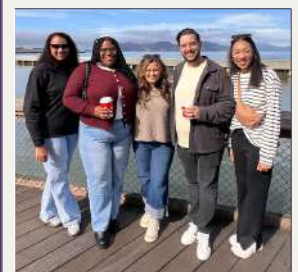
FYRI Staff in San Francisco, CA

Welcome to the new First Year and Retention Initiatives Office! This team is dedicated to all things retention, including Summer Orientation and Miss UNA. After recently attending NODAC in San Francisco, the team has returned with fresh ideas and innovative strategies to keep UNA on the cutting edge of retention and orientation programming. Their work will play a critical role in supporting student success from the first day on campus through graduation. We're grateful for the energy, creativity, and commitment this team brings to the UNA community. We're excited for what's ahead!