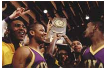
1991 Men's National Championship Team