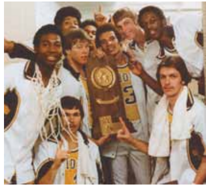
1979 Men's National Championship Team