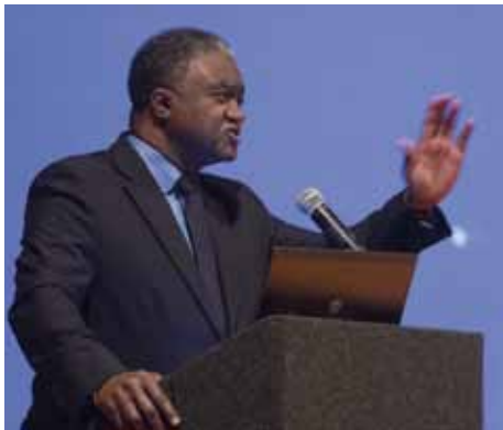
DR. MARTIN LUTHER KING, JR., was a man who practiced what he preached. To honor his legacy and the life he led, the Office of Student Engagement and Baptist Campus

Ministries came together mid-January to celebrate his many acts of selflessness and love.