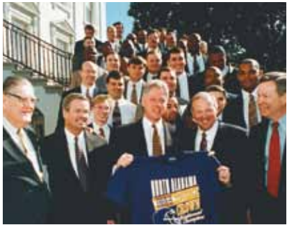
White House Visit in 1995