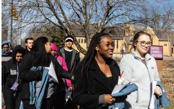
Martin Luther King Jr. Day