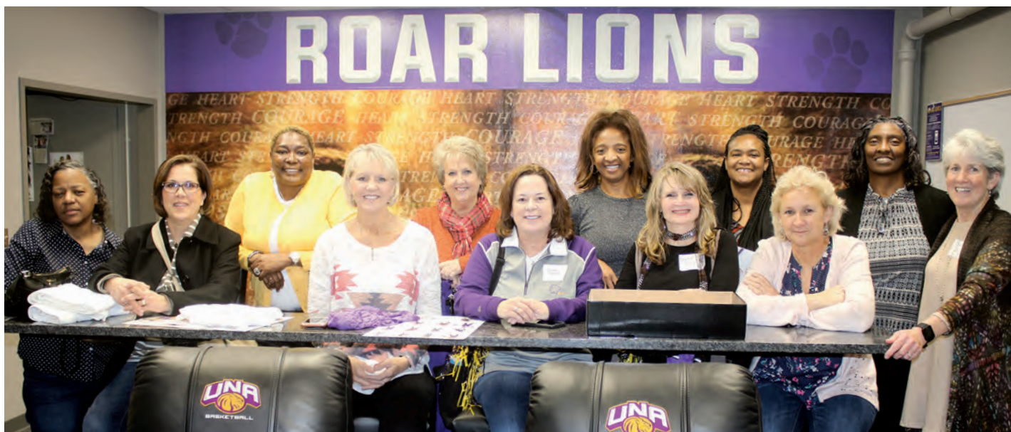
Several of the former players toured the updated UNA facilities including the women's basketball locker room.