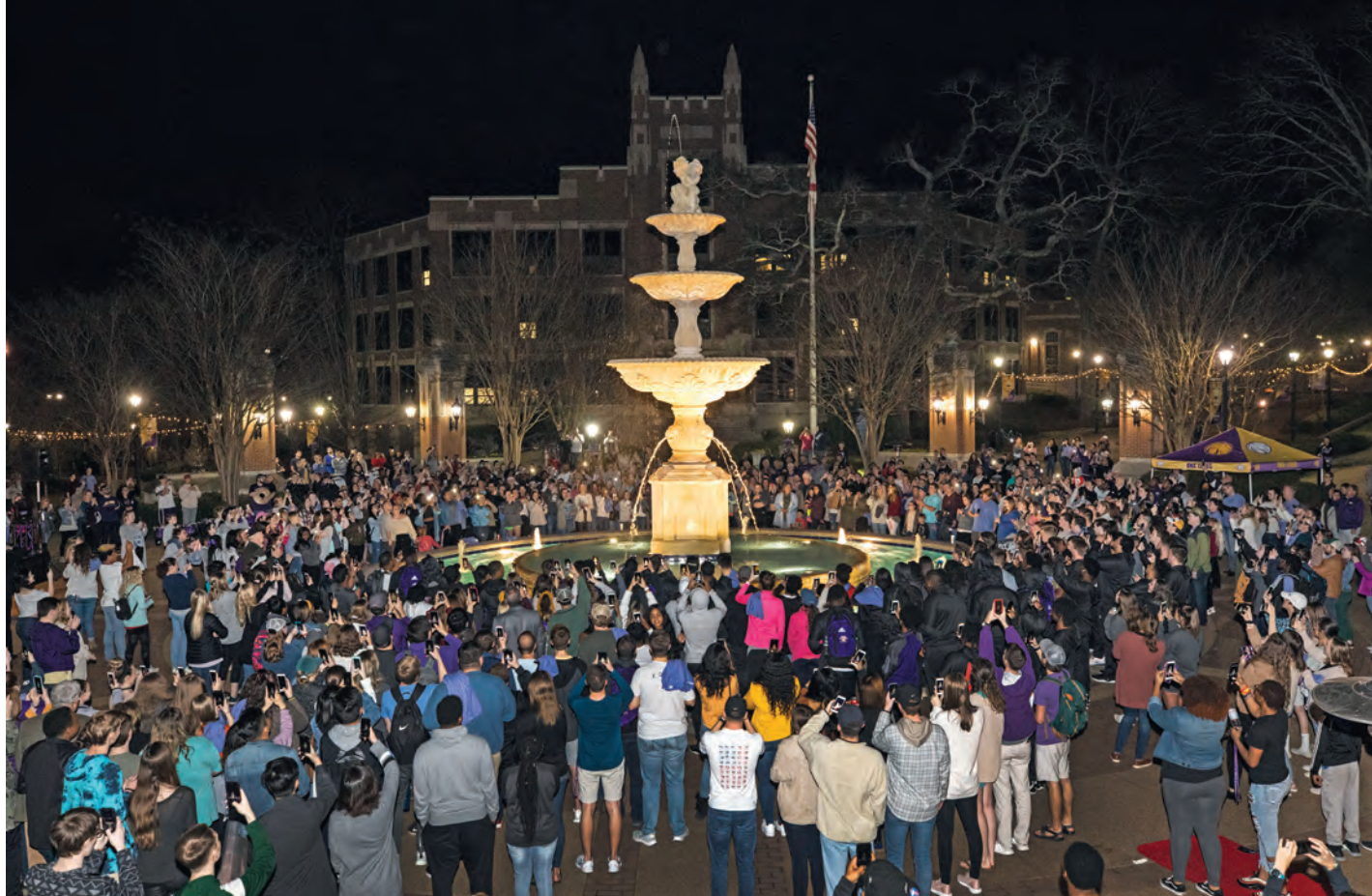
2019 Lighting of the Fountain