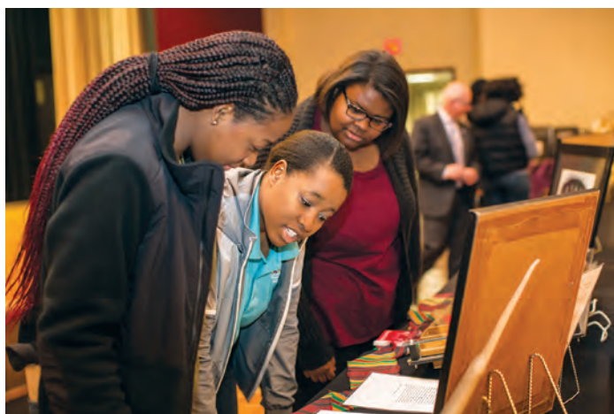
Sankofa African American Traveling Museum

"Ultimately, we want our campus to be a reflection of the global world we live in, to be honest," he said. "We want the ideals of acceptance and respect to bleed over to our student body, and to our faculty and staff. And we want those ideals to reach our community as well."