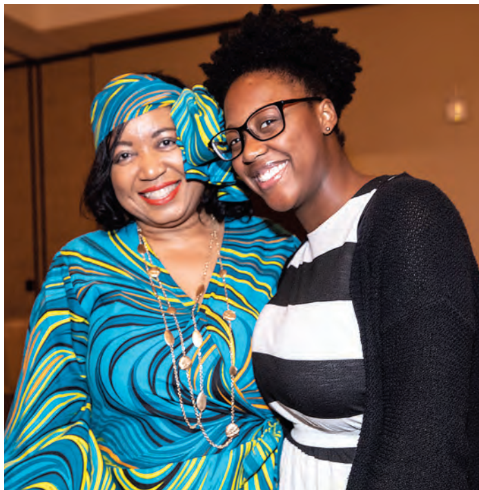
BSA Black History Gala

Through an application process that may also take into account diversity of thought, geographic diversity, or other factors, the fellowship seeks to draw applicants historically underrepresented in academia.